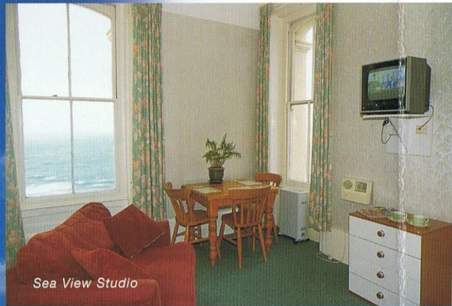
Sea View Studio

Carnock House is superbly situated on the Esplanade overlooking the South Beach with views of Caldey Island and St. Catherine's Island Fort and across the bay to the Sower Coast and North Devon beyond. The picturesque town centre of Tenby with its Medieval walls and maze of narrow streets is reached within a few minutes' level walk. Castle Hill, the attractive Georgian Harbour, railway station, bus and car parks are all within easy walking distance. With its two wide sandy beaches, Tenby can offer a relaxing time for the full time of your stay, or used as a base to explore all Pembrokeshire has to offer.