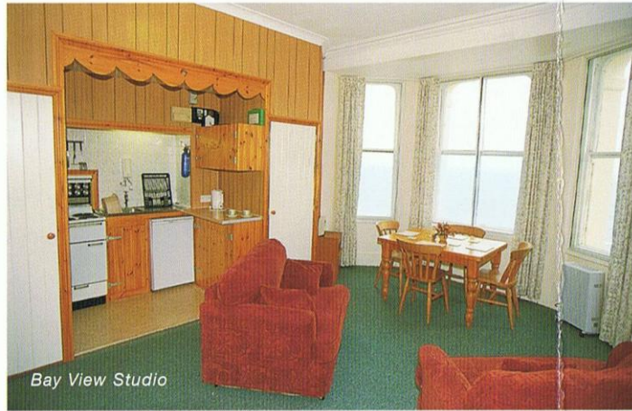
Bay View Studio

Carnock offers a choice of seaview and townside studio accommodation as well as St. Margaret's flat on the third floor and Caldey Flat on the lower ground floor.